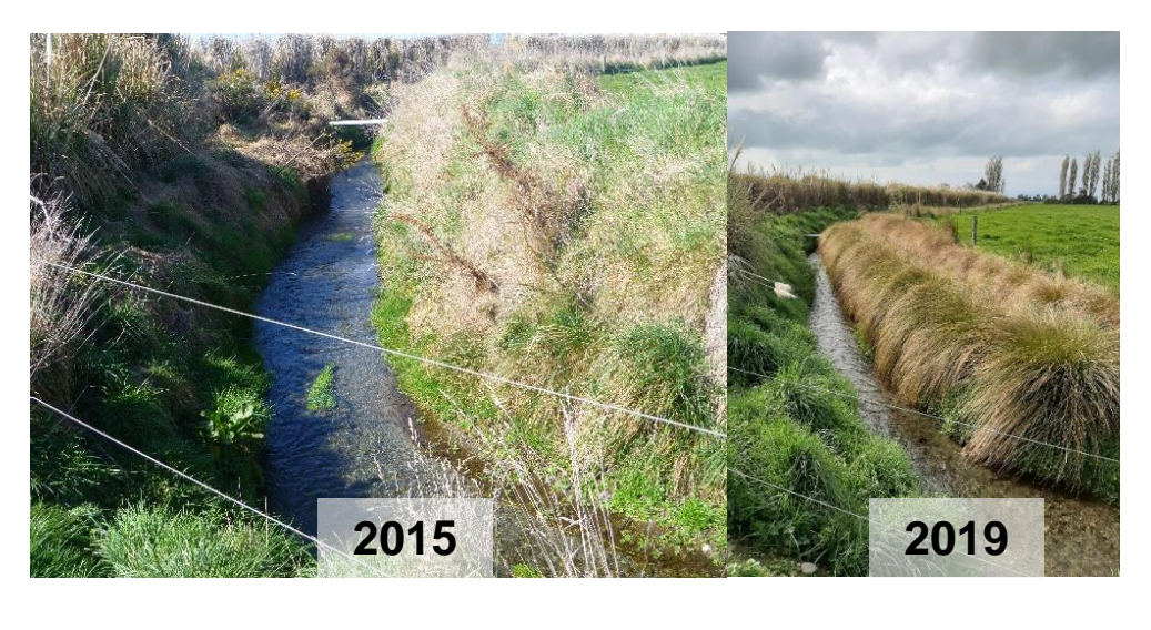
Figure 2: Waimanu Farm Stream Restoration Before and After Rebattering and Planting

In total, $30,000 has been spent on biodiversity planting in the riparian zone, with a further $16,000 spent on fencing. A significant amount of time has been spent by the community assisting the restoration of the stream by providing labour to reduce the costs.