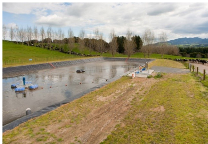
An example of a good effluent pond

If your effluent storage does not meet the DESC recommended volume and you don't have a plan to upgrade, then you will receive a “C” or “D” grade for your audit. If you are unsure of your obligations, please contact the Irrigo Environmental team for more information.