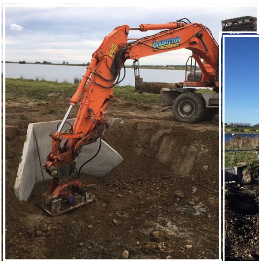
Automation and Telemetry installation on open race

Irrigo is in the process of recruiting two new Environmental Advisors and we will introduce them in the next newsletter.